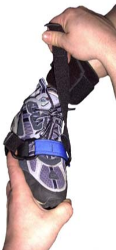
Pronation Fig. 2

An effective and active treatment in the correction of a foot/ankle misalignment and resetting of the neuro-muscular firing patterns involves multi-plane activities performed in an un-weighted environment (Fig. 1) utilizing specific external support. A forefoot strap (in this instance it is the Pneu-Gait™) can be used to correct pronation by supporting the forefoot at the first ray, while at the same time elevating the longitudinal arch. This is accomplished by anchoring the strap to an ankle cuff (Fig. 2). Conversely, while correcting for supination, the forefoot strap provides support at the distal lateral column, again anchoring on the ankle cuff (Fig. 3). Eversion of the rear-foot, that often accompanies pronation, is corrected by bringing the subtalar joint into a neutral position utilizing external straps that support from the medial to the lateral aspect of the ankle and are anchored to ankle cuff (Fig. 4) Inversion of the rear-foot would then be reduced placing the straps from the lateral to the medial aspect of the ankle (Fig. 5).